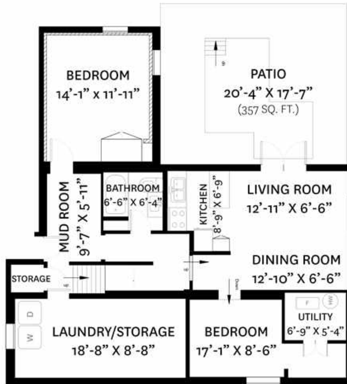
LOWER FLOOR PLAN Ceiling Height: 7'-2"